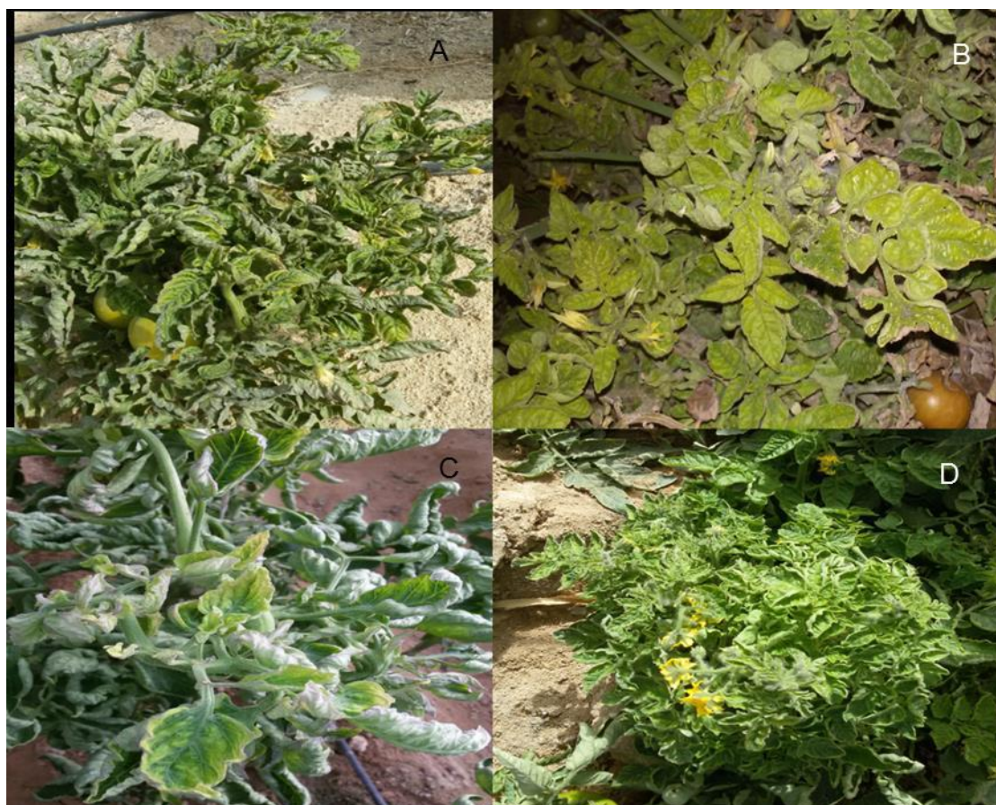
Fig. 1. Symptoms on TYLCV infected tomato plants. A: leaf curling, B and C: yellowing, D: stunting.

In order to study the natural selection, the proportion of synonymous substitutions per synonymous site (Pis) and the proportion of non-synonymous substitutions per non-synonymous site (Pia) were calculated using DnaSP 5.0 program by the method described by Nei & Gojobori (1986). The Pi(a)/Pi(s) ratio showed the selection pressure in progression for coat protein of the subpopulations of variant collection areas. Selection at individual codons was checked by the fixed effects likelihood (FEL) and internal fixed effects likelihood (IFEL) methods which were available in the DATAMONKEY server ( http://www.datamonkey.org ) (Kosakovsky-Pond & Frost, 2005). In order to classify the site as positively or negatively selections, the cut-off P -value was selected to be 0.1 and only selections were determined to be significant by both methods were considered as positive selections. The statistic F_{ST} (Weir & Cockerham, 1984) was used to estimate inter-subpopulation genetic differentiation and the gene flow by using DnaSP 5.0 program.