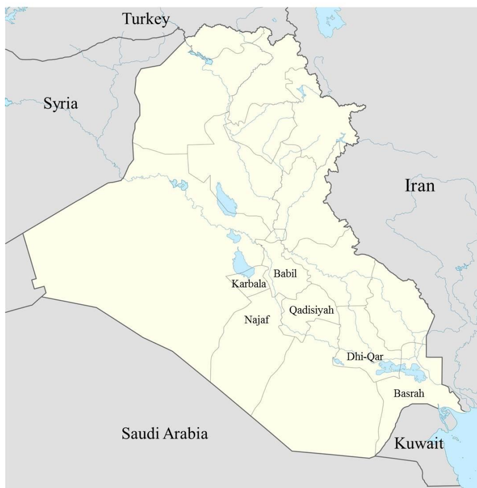
Fig. 2. Map of Iraq showing six main tomato producing provinces regions, surveyed for TYLCV presence.